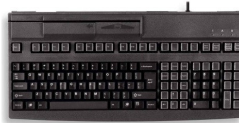
Full Size QWERTY POS Keyboard G80-8200 Series