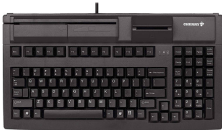
Compact QWERTY POS Keyboard G80-7040LUVU-2