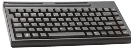
Mini POS Keyboard G86-51410EUADAA