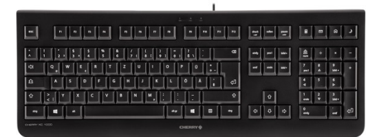
Full Size QWERTY POS Keyboard JK-0800 Series