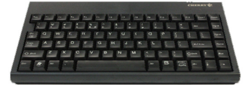
Mini POS Keyboard G86-51400EUADAA